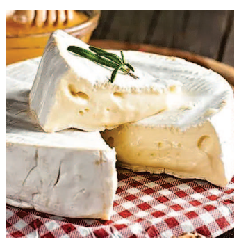
Fromage D'Affinois $15.00 lb.

Our most popular Brie. Mild, and oh so creamy. Another great choice for your holiday cheese board.