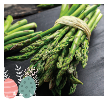
LOCALLY GROWN California Long Green Asparagus